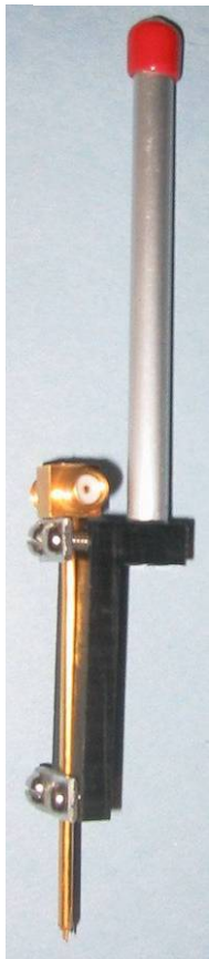
Fully assembled GigaProbes™ GPMMA with Extender Adapter