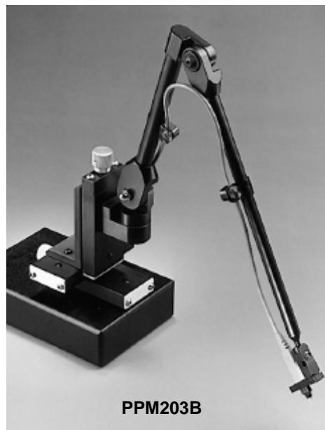
GigaProbes™ GPMMA attaches directly to the end of the Tektronix PPM203B